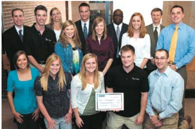
SIUE American Marketing Association Student Organization receives First Place Enterprise Award

Enterprise Rent-A-Car Foundation recently concluded its 2007-2008 incentive program for SIUE School of Business students. The program, in its second year at the School, recognizes dedicated, hardworking students who are active in one of the School's 15 student organizations and who go above and beyond their daily college responsibilities. It also provides these students with exposure to Enterprise Rent-A-Car executives, creating excellent recruitment opportunities.