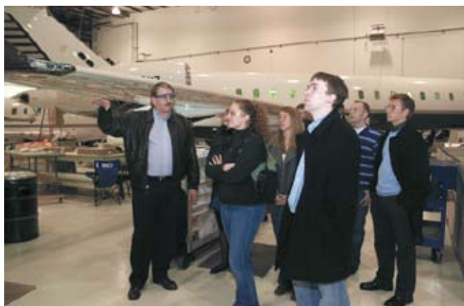
SIUE Students touring Midcoast Aviation