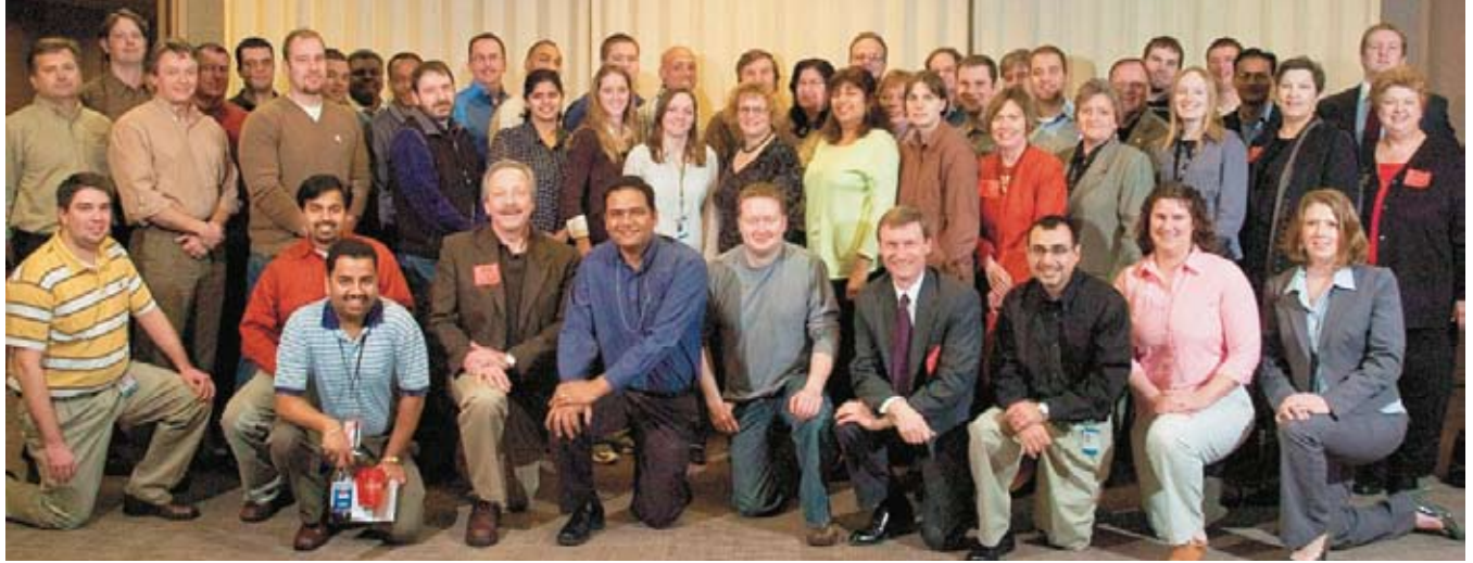
SIUE School of Business hosted a lunch for alumni at AT&T in downtown St. Louis February 25, 2008.